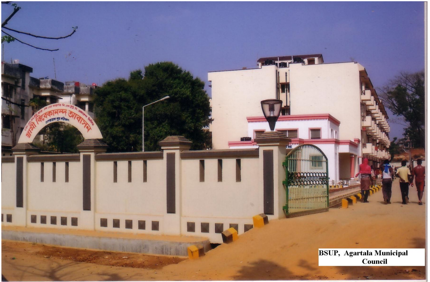
BSUP, Agartala Municipal Council